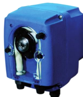
B3-V Dosing Pump

The B series are a range of peristaltic pumps fixed and variable flow rates designed for discontinuous use. Both the B Series and BH Series are perfect for smaller dosing systems that require small amounts of chemical addition in short periods of time.